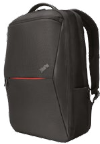
ThinkPad Professional 15.6" Backpack