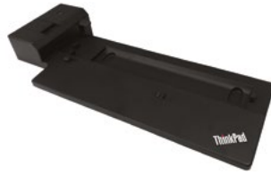
ThinkPad® Pro Docking Station