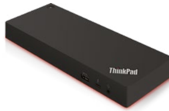
ThinkPad® Thunderbolt™ Workstation Dock