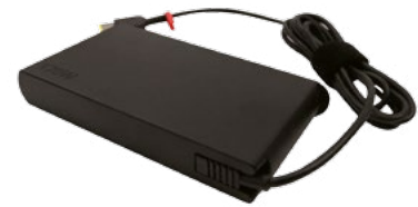
New Slim ThinkPad® 230W AC Adapter