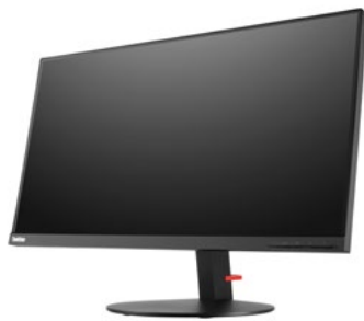
ThinkVision® P27u Monitor