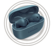
Lenovo TWS YOGA PC Edition