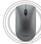
Lenovo Yoga Slim Mouse