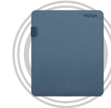
Yoga 14-inch Sleeve